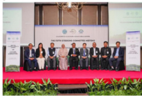
Figure 1 Group Photo of the 5th SANFRI Steering Committee Meeting

The meeting has achieved its main goals: (1) Conducted the SANFRI leadership election for 2026-2027, selecting the Chair institution (National Research and Innovation Agency of Indonesia) and Vice-Chair institution (Royal Forest Department of Thailand); (2) Reviewed progress on SANFRI activities during 2024-2025; (3) Discussed and adopted the 2026-2027 Work Plan and revised the guidelines of Small Research Grant program; and (4) Planned for the 6th SANFRI Steering Committee Meeting.